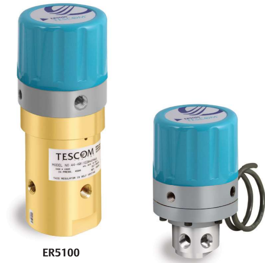
ER5100 (WITH 44-4000 SERIES REGULATOR)